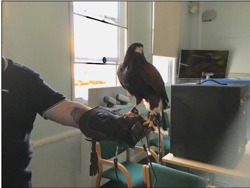
A hawk used to deter gulls from nesting