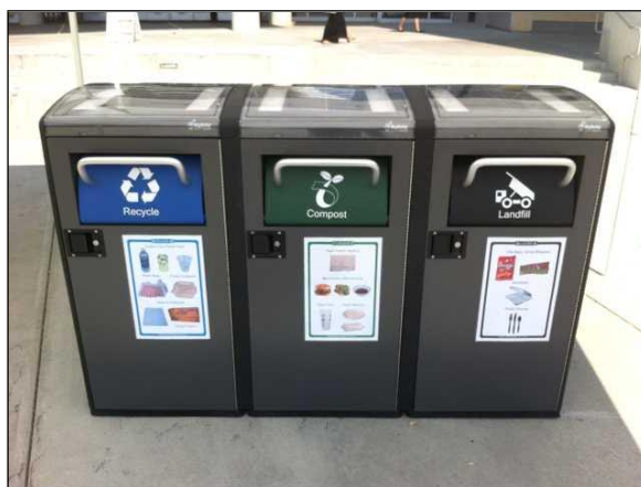
Belly bins can store more waste than traditional litter bins and are gull proof