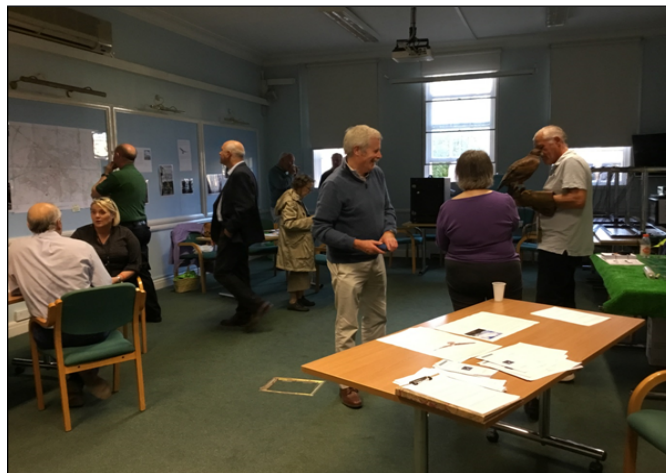
Attendees talking to members of the Gull Task Group at the drop-in event