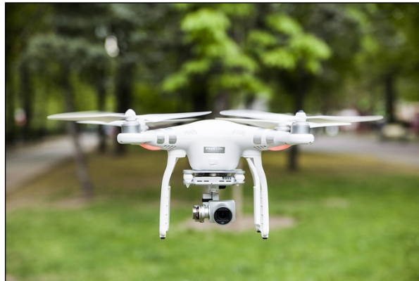
The use of a drone could help identify nest sites more effectively

Recommendation - Recognising that in the short time scale available it will not be possible to find and treat every nest, CBC to take a more proactive approach to treating nests on residential properties. Where CBC cannot safely access the property to treat the nest, give information to property owners about private contractors who may be able to undertake the work