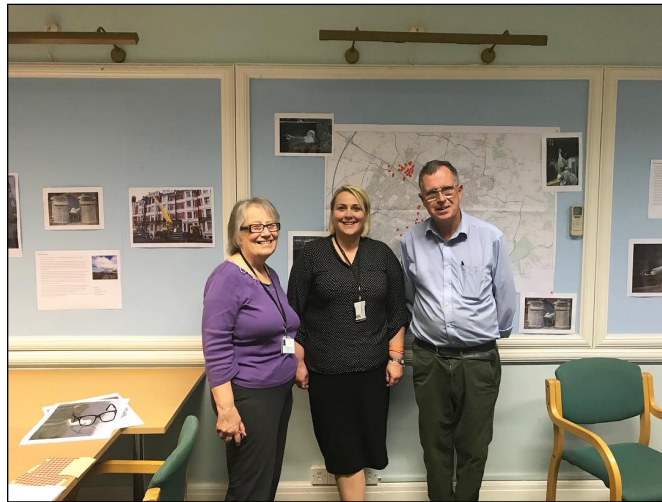
Members of the Urban Gulls Task Group at the drop-in session